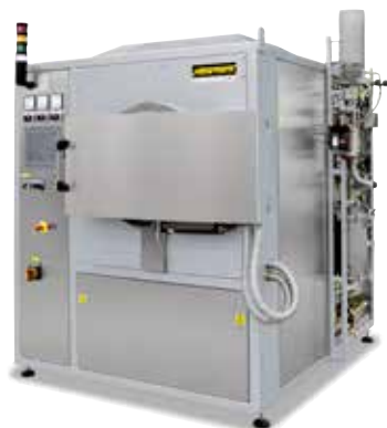
Retort furnace NRA 50/09 H 2