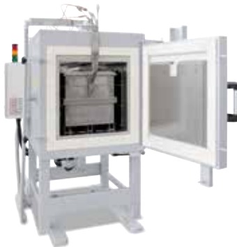
Forced convection furnace N 250/85 HA with annealing box