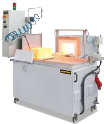
Protective gas hardening system SHS 41

Depending on the application, the material is allowed to quench, for example to obtain the desired toughness, and the hardness is again reduced.