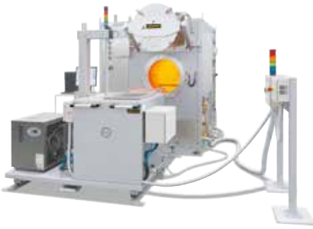
Hot-wall retort furnace NR 50/11 with semi-automatic quenching device for hardening of steel or titanium