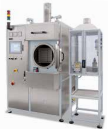
Retort furnace NRA 40/02 with cupboard for the acid pump