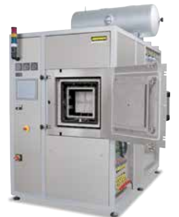
Retort furnace VHT 40/16-MO H 2 with hydrogen extension package and process box